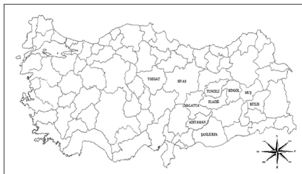
Figure 1. Collection sites of the studied Hypericum scabrum populations from Turkey

A Varian 3800 gas chromatograph directly interfaced with a Varian 2000 ion trap mass spectrometer (VarianSpa, Milan, Italy) was used with injector temperature, 260°C; injection mode, splitless; column, 60 m, CP-Wax 52 CB 0.25 mm i.d., 0.25 \mu\text{m} film thickness (ChrompackItalys.r.l., Milan, Italy). The oven temperature was programmed as follows: 45°C held for 5 min, then increased to 80°C at a rate of 10°C/min, and to 240°C at 2°C/min. The carrier gas was helium, used at a constant pressure of 10 psi; the transfer line temperature, 250°C; the ionization mode, electron impact (EI); acquisition range, 40 to 200 m/z; scan rate, 1 us -1 . The compounds were identified using the NIST (National Institute of Standards and Technology) library (NIST/WILEY/EPA/NIH), mass spectral library and verified by the retention indices which were calculated as described by Van den Dool and Kratz (25). The relative amounts were calculated on the basis of peak-area ratios. The dendograms and map of collected samples are seen in Figure 1,2 and identified constituents, major compounds of ten taxa H. scabrum calli and collect informations of studied H. scabrum populations are listed in Table 1.