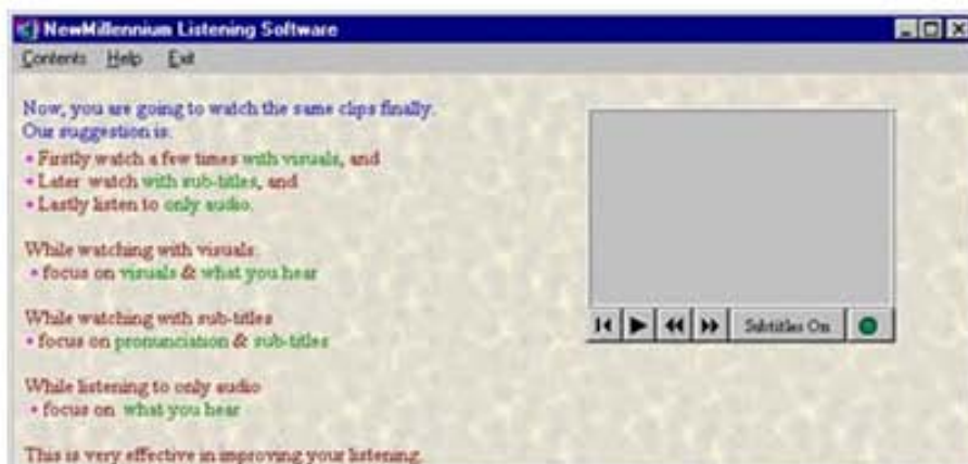
Figure 1. A sample of the material where the LLs can re-listen to the same audio-visuals without visuals at the post listening stage.

In order to encourage LLs to rely heavily only on what they hear (i.e. speech) and progress their listening skills, LLs can, for instance, be given the opportunity of re-listening to the same audio-visuals without the visuals at the post-listening stage (Figure 1). This is what the social learning (Robinson 1989:119-130; Bandura 1977) and the conditioning (Skinner 1953) theories of learning require us to do, as "repeated exposure to similar or parallel stimuli, with spaced practice over time, produces behaviour changes more effectively than do one-time learning trials" (Robinson 1991:164; Robinson 1989:119-133; Carroll 1977: 507). Such an opportunity can, additionally, enable LLs to (1) focus upon speech-only, (2) improve their acoustic channel (i.e. getting used to pronunciation, stress, intonation and different accents), (3) find out whether they can understand the same LTs without visuals and (4) see what kind of difficulties they might have when there are no visuals in real-life. They also prepare LLs for similar real life situations.