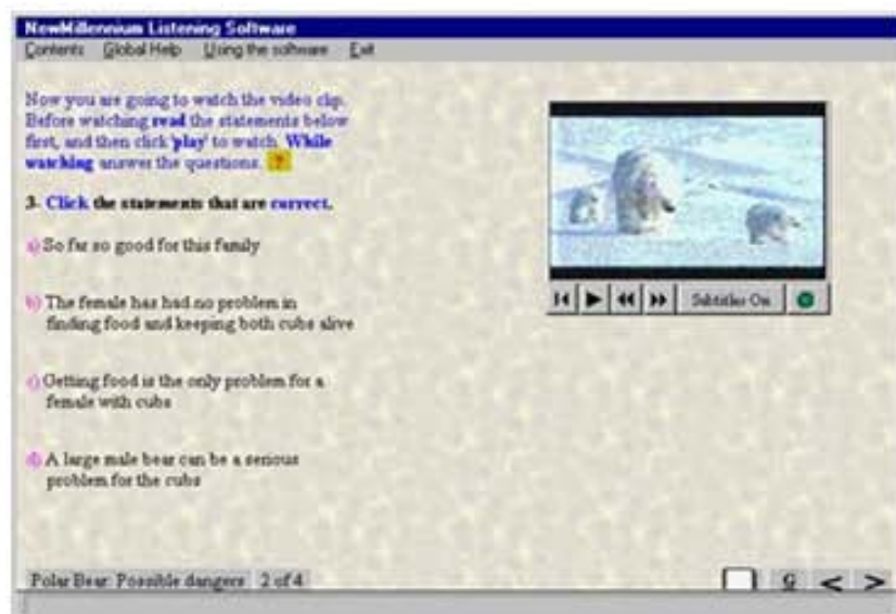
Figure 6. A sample of video-only as a media-type.

Video-only: Eight minutes of audio-visuals were in the form of video-only. It featured in one unit and consisted of 8 lessons. It featured 10 different clips, the length of which varied from 18 to 93 seconds (Figure 6). In these lessons, the LLs were requested to complete the preparation exercises at the pre-listening stage. Then, the LLs were requested to watch the video-only media types and answer the pertinent questions (see, for example, Exercise 3 in Figure 6). Later, they were encouraged to watch initially with subtitles and lastly listen to it as audio-only.