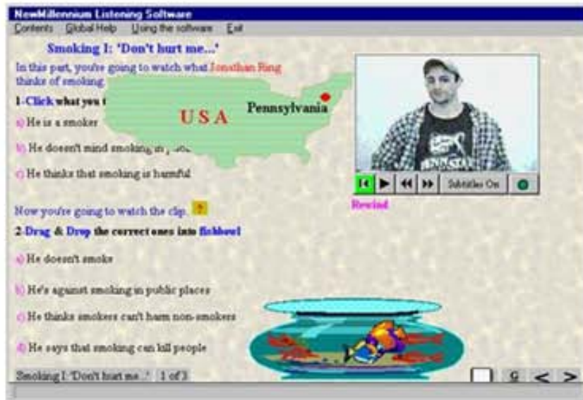
Figure 5. A sample of video-THs+visuals as a media type.

were supplementary contextual. Video (THs) + visuals featured in two units and consisted of 8 lessons. In total, it featured ten different clips, the length of which varied from 21 seconds to 02:59 minutes. In these lessons, the LLs were requested to complete the preparation exercises at the pre-listening stage (see Exercise 1 in Figure 5). Then, the LLs were requested to watch the video (THs) + visuals media types and answer the pertinent questions (see Exercise 2 in Figure 5). Later, they were encouraged to watch initially video (THs) + visuals without visuals, then with subtitles and lastly listen to it as audio-only (see suggestions in Figure 1 above).