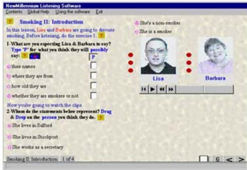
Figure 3. A sample of audio-only as a media type.

Audio-visuals: The rest of the LTs were presented as audio-visuals in different forms either as audio + animation, audio + (supplementary) visuals, video (THs) + (supplementary) visuals or video-only.