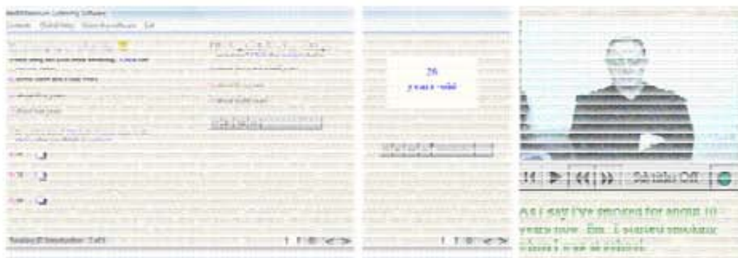
Figure 2. A sample of the material where the LLs can re-listen to the same audio-only as audio + visuals and as video.

Similarly, LLs can also be provided with the opportunity of re-listening to the same audio-only with (supplementary) visuals or as video at different stages of listening (Figure 2). Such provision can enable LLs to further benefit from the positive aspects of visuals, which are already well-documented (Moreno and Mayer 2002: 156-63; Gyselinck et al. 2002: 675, 680; Al-Seghayer 2001: 203; Brett 1997: 46-7; Mueller 1980: 335-40). This is also what the dual-coding theory (Paivio 1986), noticing hypothesis (Robinson 1995; Schmidt 1990; Schmidt and Frota 1986) and the attention theory (Schmidt and Frota 1986; Schmidt 1990:133) require us to do. The underlying assumption is that one element that targets to teach one thing is presented using both verbal and visual elements (i.e. two elements), which can draw attention to salient features and provide more paths of recall. This can even expand limited working memory (human cognitive capacity), as the processing of information requires using both verbal and visual senses (Kalyuga 2000: 1). Such provision also provides LLs with repeated exposure, which is a requirement of the social learning (Robinson 1989:119-130; Bandura 1977) and the conditioning theories (Skinner 1953).