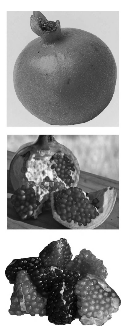
Figure 27.1. Pomegranate fruit and arils of different types. For color detail, please see color plate section.

Recent clinical studies have postulated that pomegranate has several beneficial health effects, including antioxidant (Gil et al., 2000; Singh et al., 2002), antiviral (Zhang et al., 1995), antibacterial (Prashanth et al., 2001), and wound-healing effects (Murthy et al., 2002). Moreover, pomegranate has been used to treat infectious (Holetz et al., 2002), cardiovascular (Aviram et al., 2002) and oral diseases (Vasconcelos et al., 2003), breast cancer (Mehta and Lansky, 2004), prostate cancer (Lansky et al., 2005), skin tumorigenesis (Hora et al., 2003; Afaq et al., 2005), and colon carcinogenesis (Kohno et al., 2004; Sharma et al., 2010).