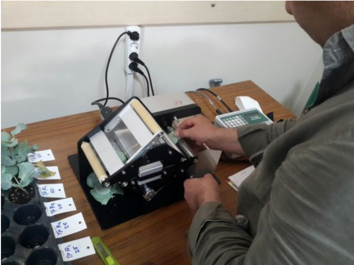
Figure 3.9. Leaf area measurement with LI-3100C portable area meter