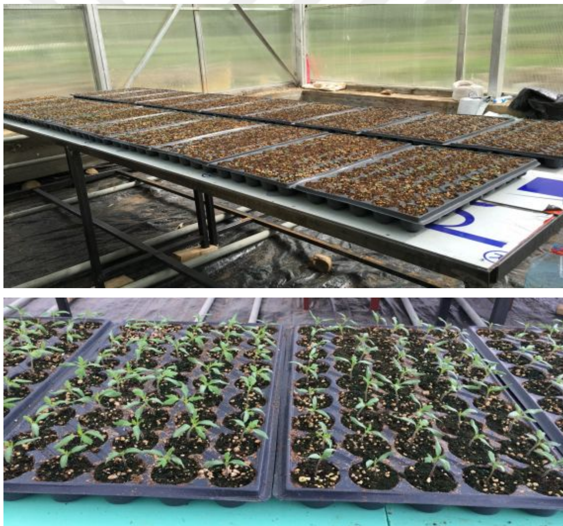
Figure 3.5. Seedlings trays placed on greenhouse benches

The experiment was carried out at an automated and heated polycarbonate-covered greenhouse with natural daylight conditions at average day/night temperature of 29/18°C and relative humidity of 55%. The greenhouse experiment investigated the effects of prohexadione calcium (Pro-Ca) concentrations on the growth and quality of tomato and cabbage seedlings. Tomato and cabbage seeds were sown (two-seed/cell) into 45-cell plastic trays (cell volume 75 cm 3 ) filled with growing media filled with a media consisting of peat and perlite in the ratio of 4:1 and placed on a greenhouse bench (Figure 3.5.).