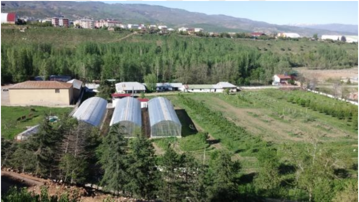
Figure 3.1. The research center where the experiments were conducted.

The greenhouse experiments were conducted from April 2016 to July 2016 at the Horticultural Sciences Research Center of Bingöl University, in Bingöl, Turkey (38°53'N, 40°29'E, at 1139 m altitude) (Figure 3.1).