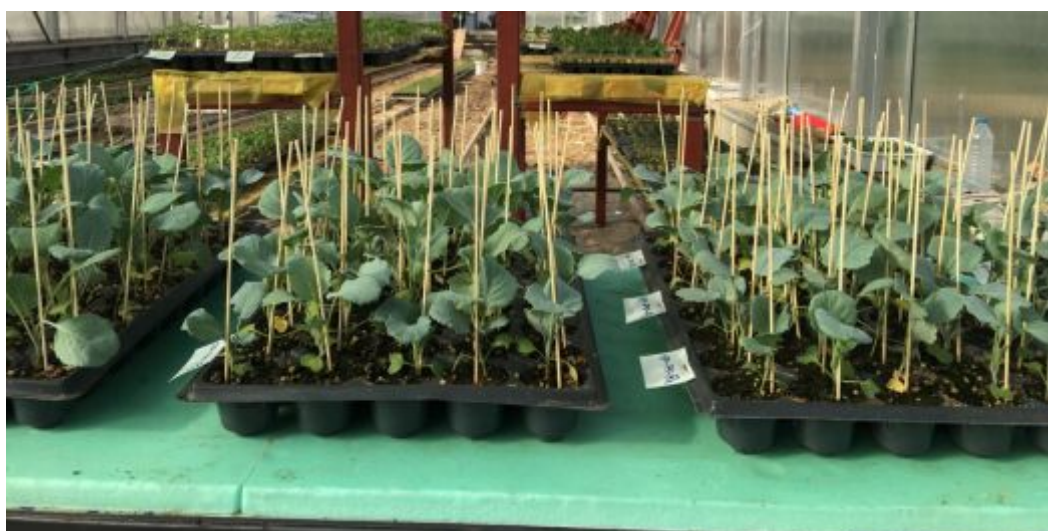
Figure 3.7. Five-week old cabbage seedlings