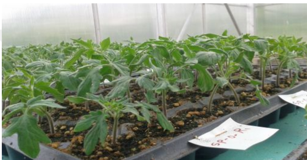
Figure 3.6. Five-week old tomato seedlings

Irrigation of seedlings was manually performed using a sprinkler nozzle connected to a hose and performed daily or twice a day according to the environmental conditions using enough water to avoid stress in the cultivated seedlings. Seedlings were fertilized with 18-18-18 N-P-K soluble fertilizer at a rate of 100 \text{ mg L}^{-1} \text{ N} once a week. At the emergence of the third true leaf, tomato and cabbage seedlings were sprayed one time with 0, 25, 50, 75 or 100 \text{ mg L}^{-1} Pro-Ca solutions containing 0.1% Tween 20 as a wetting agent. A solution containing 0.1% Tween 20 was also applied to the control plants.