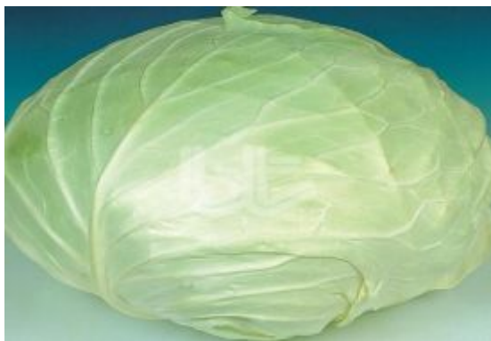
Figure 3.3. Beyaz Lahana Bafra cabbage variety

BT H2274 is a bush type tomato. It is mid-seasonal and it can preserve its hardness when it ripens. It can be grown in outdoor within all regions in Turkey. It is Mid-early variety and harvested in 80 days. Fruits are roundish, red, and fleshy with thick skin. It is suitable for the transportation. The weight of fruit is about 160-180 g. Average yield is 60-80 tons/ha.