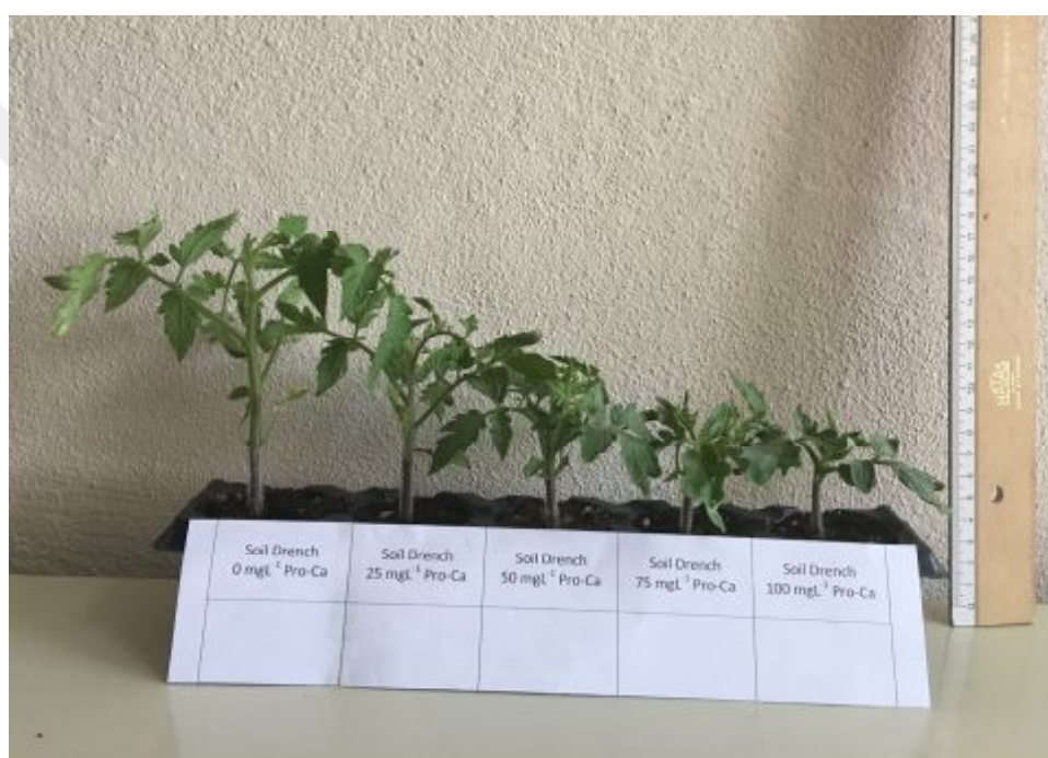
Figure 4.1. Pro-Ca applied tomato seedlings

The results of the study showed that all Pro-Ca concentrations significantly reduced tomato seedling height as compared to the control at both seedling ages (Figure 4.1). The higher concentrations of Pro-Ca exhibited significant reduction in 25 day-old tomato seedlings height as compared to control. The treatments of 75 and 100 mg L -1 Pro-Ca produced the shortest tomato seedlings (4.23 and 3.87 cm, respectively) while the control treatment (0 mg L -1 Pro-Ca) produced the tallest tomato seedlings (7.46 cm). With the application of 75 and 100 mg L -1 Pro-Ca tomato seedling height was suppressed by 43 and 48%, respectively compared to the control (Table 4.1).