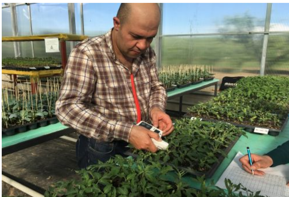
Figure 3.8. Measurements of the relative leaf chlorophyll content tomato seedlings with a chlorophyll meter (Figure 3.8) SPAD-502

Ten plants per treatment were randomly chosen from each replicate to determine seedling growth parameters. Plant growth measurements of the 5-week-old tomato and cabbage transplants included seedling height (at 25 and 35 day DAP), internode length (at 25 and 35 day DAP), stem diameter (measured below cotyledons), number of true leaves, root length, relative leaf chlorophyll content with a chlorophyll meter (Figure 3.8) SPAD-502 (Konica Minolta Sensing, Inc., Sakai, Osaka, Japan), leaf area using LI-3100C portable area meter (LI-COR Biosciences, Lincoln, Nebraska, USA). The growing medium was then separated from the roots, and plant organs (shoots and roots) were separately weighted to determine fresh weights. The samples were then dried in a forced-air oven (105 °C) for 24 h and recorded as dry weights.