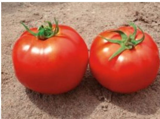
Figure 3.2. BT H2274 tomato variety

Tomato seeds ( Lycopersicon esculentum Mill. variety BT H2274, Bursa Seed Company, Turkey) and cabbage seeds ( Brassica oleracea L. var. capitata , variety Beyaz Lahana Bafra, Bursa Seed Company, Turkey) were used for the experiments (Figure 3.2 and Figure 3.3).