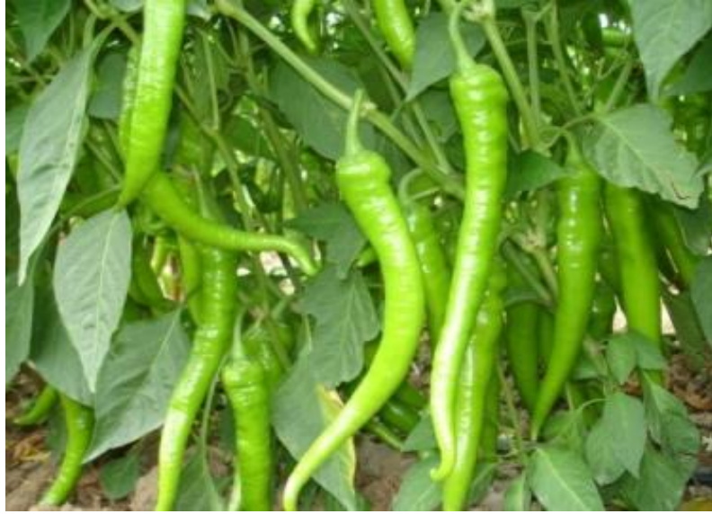
Figure 3.3. BT Ince Sivri Kıl ACI-016 pepper variety