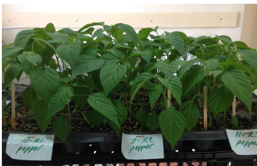
Figure 3.7. Six week old pepper seedlings