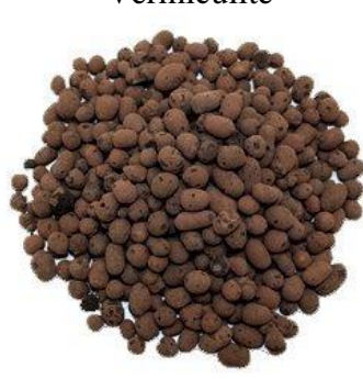
Expanded clay aggregate