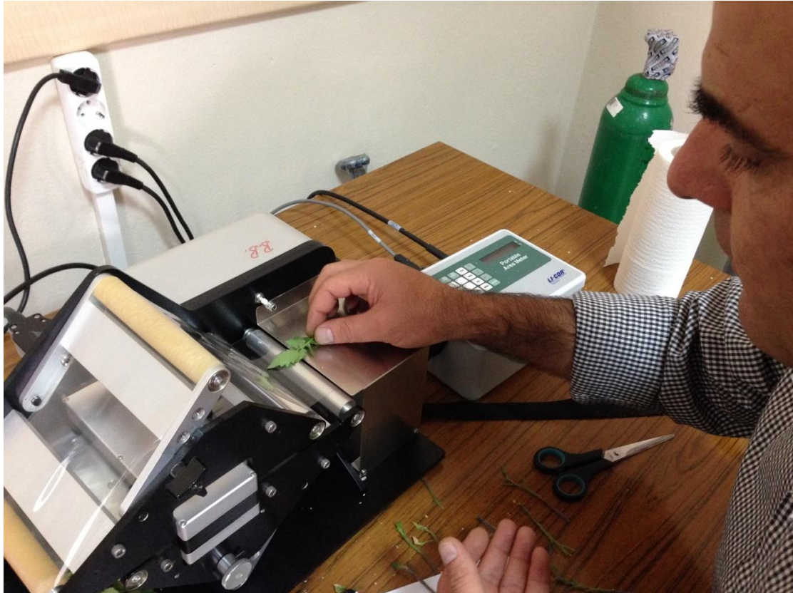
Figure 3.8 Leaf area measurement in LI-3100C portable area meter

medium was then separated from the roots, and plant organs (shoots and roots) were separately weighted to determine fresh weights. The samples were then dried in a forced-air oven (105 °C) for 24 h and recorded as dry weights.