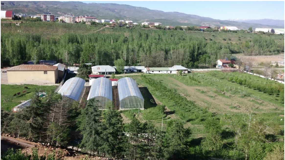
Figure 3.1. The research center where the experiments were conducted

The greenhouse experiments were conducted from April 2016 to July 2016 at the Horticultural Sciences Research Center of Bingöl University, in Bingöl, Turkey (38°53'N, 40°29'E, at 1139 m altitude) (Figure 1).