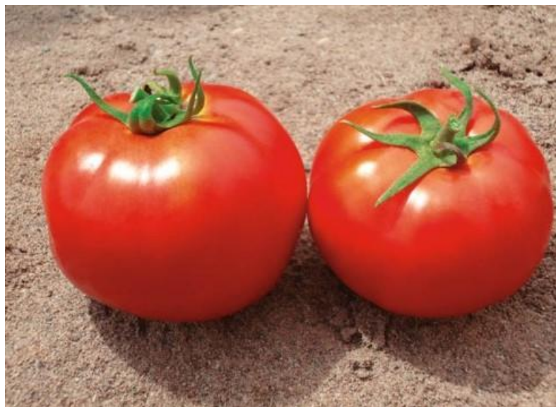
Figure 3.2. BT H2274 tomato variety

BT H2274 is a bush type tomato. It is mid-seasonal and it can preserve its hardness when it ripens. It can be grown in outdoor within all regions in Turkey. It is mid-early variety and harvested in 80 days. Fruits are roundish, red, and fleshy with thick skin. It is suitable for the transportation. The weight of fruit is about 160-180 g. Average yield is 60-80 tons/ha (Figure 3.2).