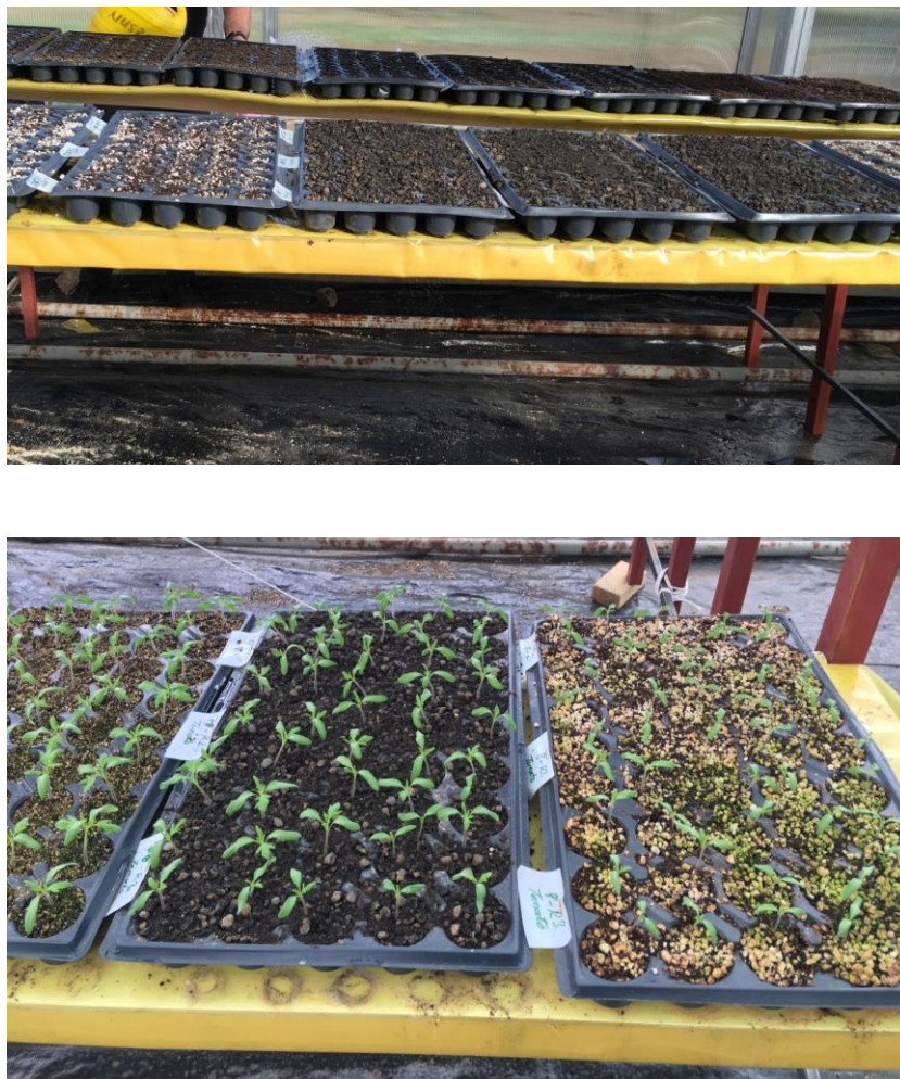
Figure 3.5. Seedlings trays placed on greenhouse benches

Irrigation of seedlings was manually performed using a sprinkler nozzle connected to a hose and performed daily or twice a day according to the environmental conditions using enough water to avoid stress in the cultivated seedlings. Seedlings were fertilized with 18-18-18 N-P-K soluble fertilizer at a rate of 100 \text{ mg.L}^{-1} N once a week. The growth period of the seedlings in the nursery was 6 weeks, until reaching commercial transplanting size (Figure 3.6. and Figure 3.7).