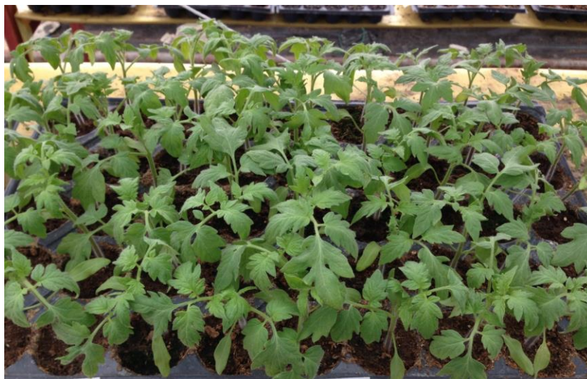
Figure 3.6. Six-week old tomato seedlings